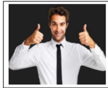
Dudes - right hand dancers

Cedar Valley Grange, 20526 52 nd Ave W, Lynnwood