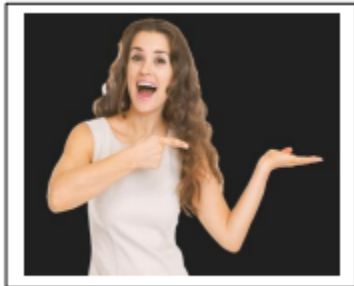
Dolls - left hand dancers